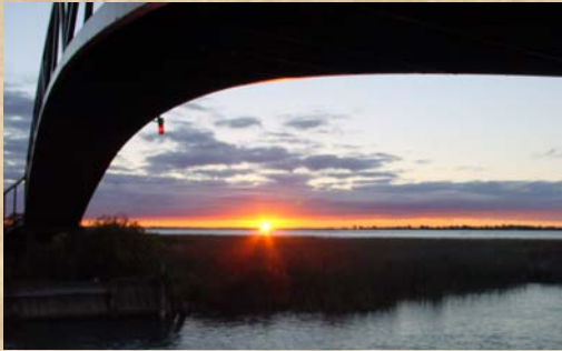
Picturesque Sunrises and Sunsets on Lake St. Clair