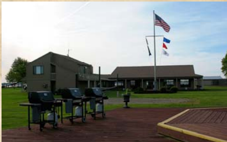
BBQ's ready for a Friday Night Cookout