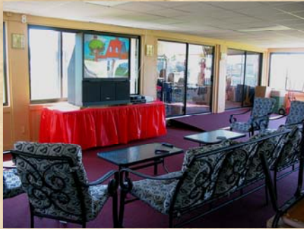
Large Screen Satellite TV