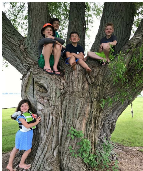
Laethem, Schaden, and Wilczinski kids in the climbing tree!