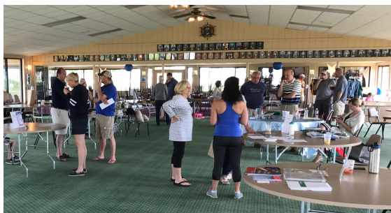
Members' business showcase in the clubhouse.