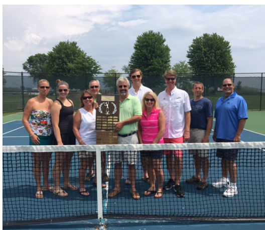
Tennis Trophy stays at CRBC for another year!