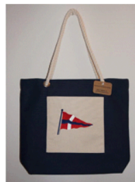
Tote Bag (16 x 13) - $29.00 Handmade and embroidered with the CRBC Burgee!